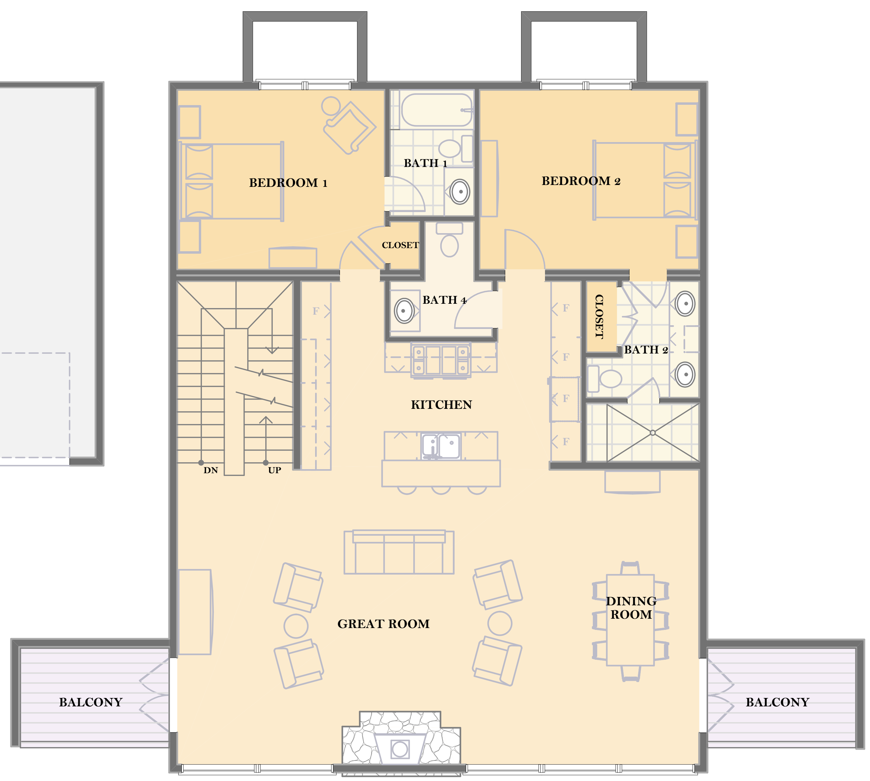
MAIN LEVEL LIVING AREA 1,606 sq ft